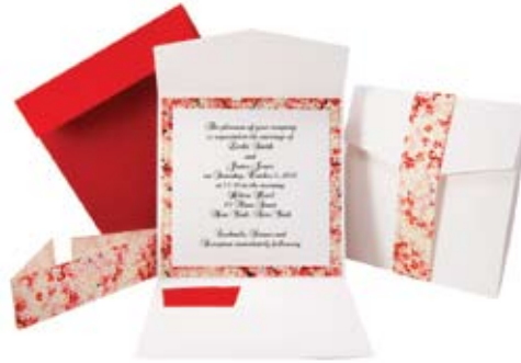
Snowflower Symphony Kit SQPFK304-RW $34 per 10 sets