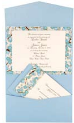
Rivus Blue Pocket Fold PFLD7-RIV Ecru Invitation Card E2C Blue Flower Tree Chiyogami CHY717P1 Ecru Response Folder E4F Summer Sky Response Envelope GCL4E-RIV