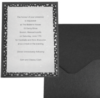
Silver Bubbles Chiyogami Pocket Card PKT7CHY-BK $25 per 10 sets