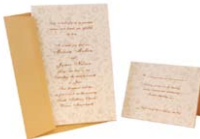
Smooth Pinus Brown Cardstock GMCLR811-PIN300 Floral Sukashi Cream JPP10221 Smooth Pinus Brown Envelope GCL9E-PIN