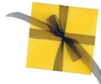
Crocum Yellow Pochette Envelope Vellum PPF-CC631 Radiant White Square Invitation Card T625C-FC Black Chiffon Ribbon RIBBON-BK