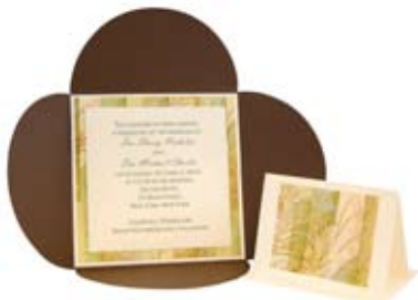
Coco Square Pochette Envelope PPF-6COCO Green Tropical Leaves Chiyogami CHY4306SQ Ecru Square Invitation Card E5C Ecru Response Folder E4F

Our in-house designers have put together these one-of-a-kind invitation ensembles to inspire you to create your own designs using our vast array of papers, invitation cards, programs, envelopes, and accessories. Create any one of these invitations at home by ordering the individual components on our web site: www.lciper.com