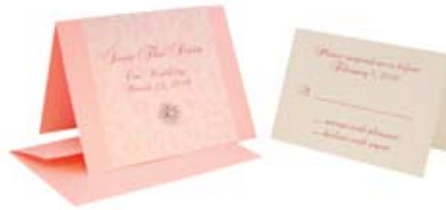
Silver Daisy Invitation Brad DFBS-SB White Floral Sukaski Vellum JPP10220 Smooth Rosa Pink 74lb Cardstock GMCLR811-PK Ecru Response Folder E4F Rosa Pink Envelope Smooth GCL2E-ROS