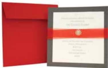
Square Subtil Metallic Card Shadow Gray GCS625C-57 Radiant White Square Invitation Card E5C Japanese Tissue Silver Fleck RYN1066P2 Red Chiffon Ribbon RIBBON-RE Silver Daisy Invitation Brad DFBS-SB Square Envelope Carnival Red CV65E-RD