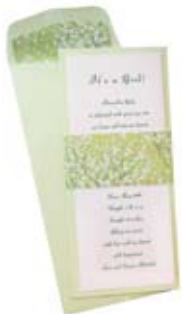
Menta Green Slim Layer Card VVSLIM-MEN Radiant White Slim Radiant White Card TTLC Baby's Breath Chiyogami CHY677P1 Menta Green Policy Envelope GCL10PE-MEN