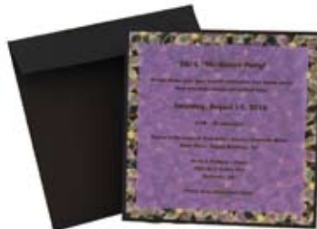
Violet Translucent Vellum GN2711VIO Black Square Invitation Card CV625C-BK Black Square Envelope CV65E-BK Clematis Chiyogami CHY3186SQ