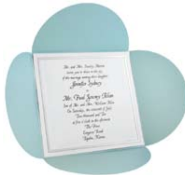
Aqua Silver Frame Pochette PPFT625SLVC $51.75 per 50 sets