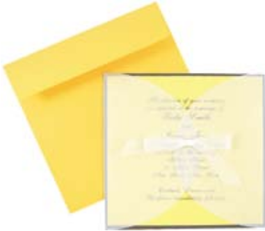
Vellum Petals Crocum Yellow Kit PPGCL6-CRO $19 per 10 sets

These affordable Invitation Kits include blank invitation cards and everything you need to print & create stylish, personalized ensembles at home.