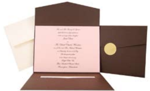
Chocolate Strawberry Pocket Fold Kit PPPFLD7-HUM $21 per 10 sets