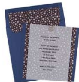
Square Envelope Smooth Pelagus GCL65E-PEL Vellum Overlay Natural Clear GN57OL Chiyogami Silver Bubbles CHY675P1 Spiral Clips Silver CLIPSPIRAL-S