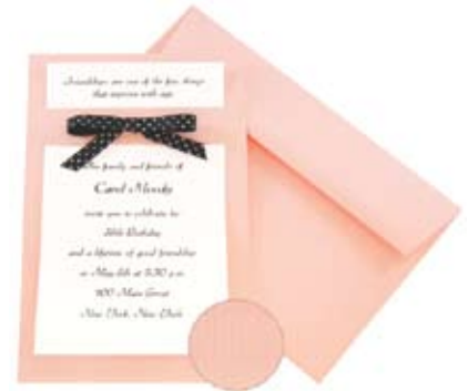
Rosa Glider Invitation Kit PPGLD9-ROS $26.50 per 25 sets